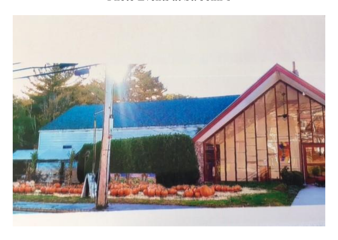
St John's Pumpkin Patch 2018. Proceeds were collected for our church and shared with the Navajo Nation in New Mexico.