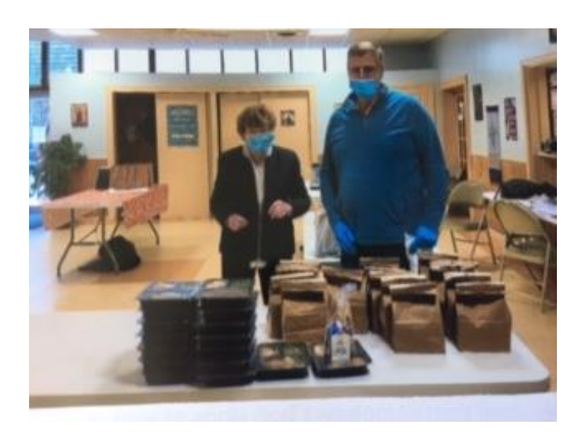
Toy Drive for families in Holbrook

Volunteers sort and package meals Monday through Friday. They deliver between 60-70 meals daily to senior citizens and others in need of this valuable program.