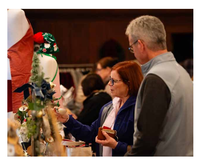
to shop. Admission proceeds are donated to a charity chosen by the Outreach Committee, and a percentage of the vendors' proceeds benefits the church's general funds.

Our biggest fund-raising events of the year, St. John's Holiday Boutique and Parish Cocktail Party bring together more than 100 volunteers and transforms Upper and Lower Weld Halls into a juried holiday market, complete with visits from Santa. The parish is invited to a cocktail party, live and silent auctions, and private shopping on Friday evening. On Saturday, we welcome more than 1,000 guests through our doors